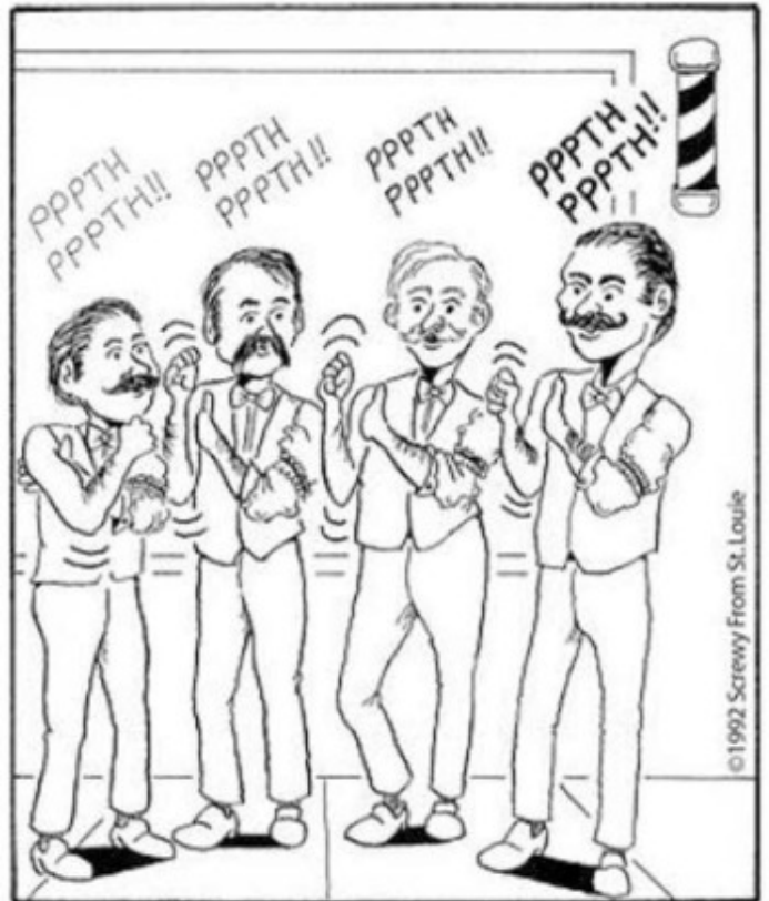
Armpit barbershop quartet.

Apparently I'm still lost.... it's a man thing .