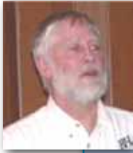
Al Kelts Tenor, Black Hills Blend

I find it exciting to hear four guys create a pleasing sound.